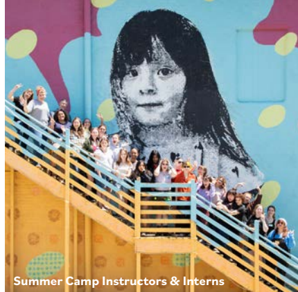
Summer Camp Instructors & Interns