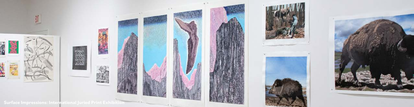
Surface Impressions: International Juried Print Exhibition