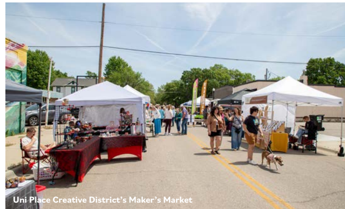
Uni Place Creative District's Maker's Market