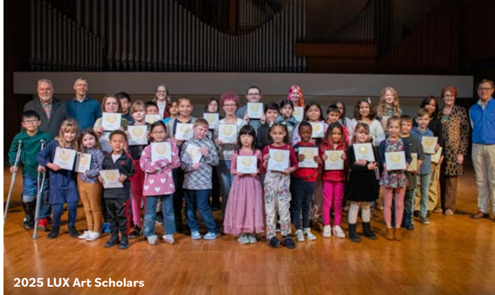
2025 LUX Art Scholars