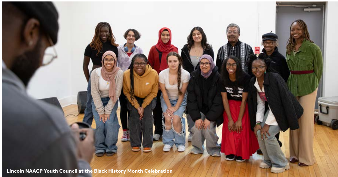
Lincoln NAACP Youth Council at the Black History Month Celebration